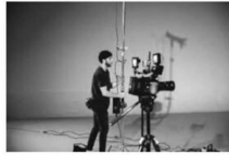
THIS FILM IS PRODUCED IN SPONSORSHIP WITH THE P.G. FILM OFFICE

SHOOT DATES: AUG. 29TH TO SEP. 10TH LOCATIONS: PRIMARILY P.G. COUNTY EMAIL: TSEDTOPIA@GMAIL.COM