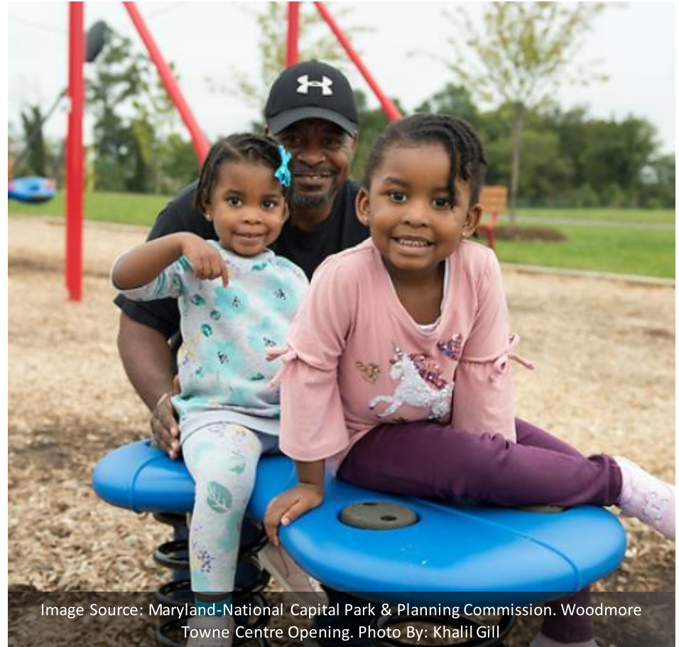
Woodmore Towne Centre Opening.