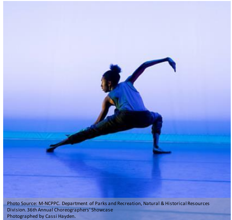
36th Annual Choreographers' Showcase