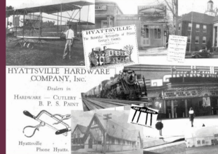
HYATTSVILLE HARDWARE COMPANY, Inc. Dealers in Hardware - CUTLERY - B.P.S. PAINTS Hyattsville - Hyattsville

Located on the same lot, the new 40,000,000-square-foot building will be one story, with parking underneath, designed to maximize green space at a prominent intersection and incorporate the relocated, iconic "Flying Saucer" canopy from the previous facility that will continue to serve as a local landmark for years to come.